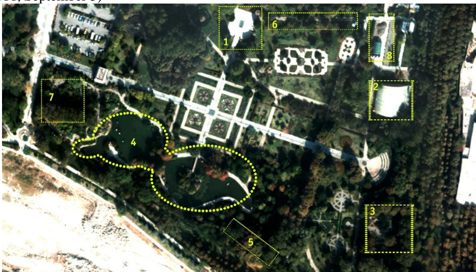
Figure 4. Aerial Photo of Flowers Garden.

(1. Canopies, 2. Cactus Garden, 3. Japanese Garden, 4. Lace, 5. Cafe, 6. Medicinal Plants Collections, 7. Rural cottage, 8. Toilet)