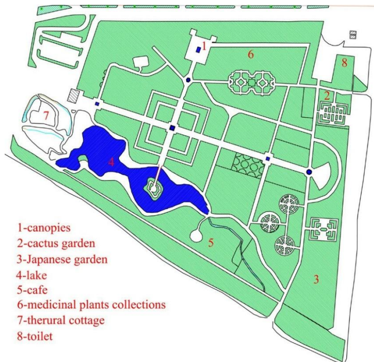
Figure 3. The Complete Map of The Flower Garden located in Isfahan, Iran, designed based on Google Map by Soleimanpour (2016, September 5)